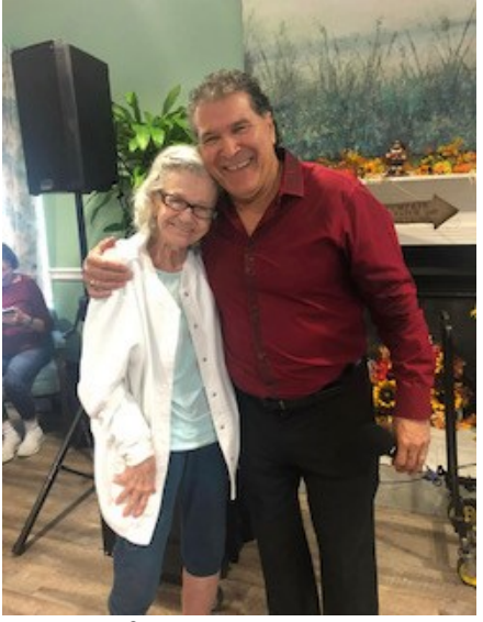
Donna & all the ladies love Louie Bravo!