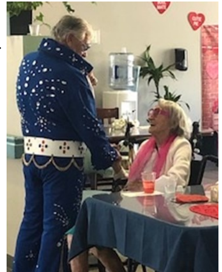
Violet being wooed by Elvis.

Cabot's elite party decorators made sure every heart was in place, and all the "xoxo's" were accounted for as we hung all of the shimmering wall décor. Covians had their pictures taken in the beautiful photo booth. It looked perfect!